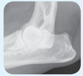
X-ray of a normal elbow joint

Radiography is commonly used to investigate joint problems.