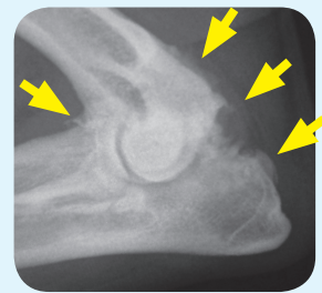
Arthritic elbow joint in a dog with lots of "fluffy" new bone (yellow arrows) around the joint, indicative of marked arthritis.